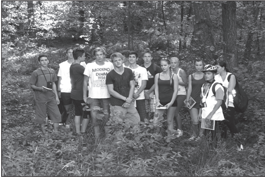
Fig. 3. At the edge of Ördög-tó – the students of Bolyai Grammar School