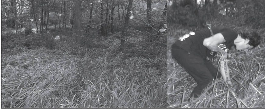
Fig. 5. On the edge of Ördög-tó we cited Nemes-Népi Zakál György