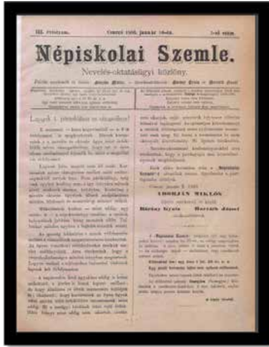
Cover page of the magazine

Népiskolai Szemle was given a new name, with expanded and rethought content, and from 1886 it was published under the name Iskolai Szemle.