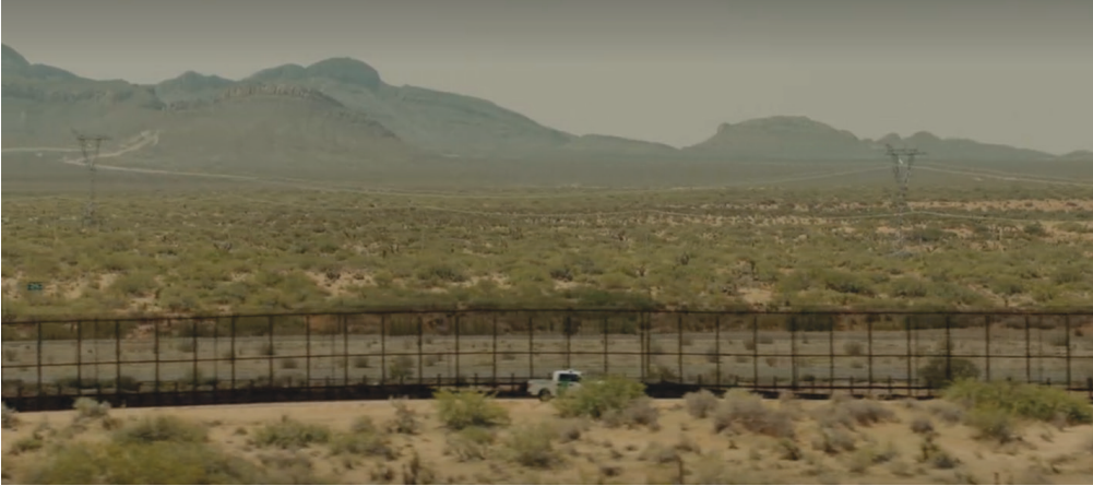
Figure 4. A part of the physical border fence in El–Juárez Region (00:24:19–00:25:24) from Sicario . Directed by Denis Villeneuve, performance by Emily Blunt, Josh Brolin, and Benicio Del Toro, Lionsgate. 2015. Netflix.

Staudt argues that “the borderlands became the gateway for international criminal organizations in gun and drug trafficking, ongoing immigration, and the violence associated therewith.” 36 In Sicario , while Matt and his team are driving across the Mexican border from El Paso to Juárez through the Bridge of the Americas port of entry, naked bodies hang from one of the bridges, displaying torture and violence through disfigured and missing body parts like heads, legs, or arms. The scene is accompanied by threatening music, and the camera moves from the moment they cross the border until they return, connoting the danger surrounding Ciudad Juárez. The “[...] pounding beat recalls a war drum. The sound alone is enough to induce sweaty palms.” 37 Johann Johannsson was nominated for BAFTA’s Best Original Music Award in the film Sicario ; the score’s originality adds relentless suspense to the border narrative. It also reflects Kate’s anxiety, fear, and shock from the start: the violent and dangerous situations she finds herself in are shocking, and they affect her life. She has many questions unanswered regarding Matt and Alejandro and their way of solving things while they give her little information to grasp.