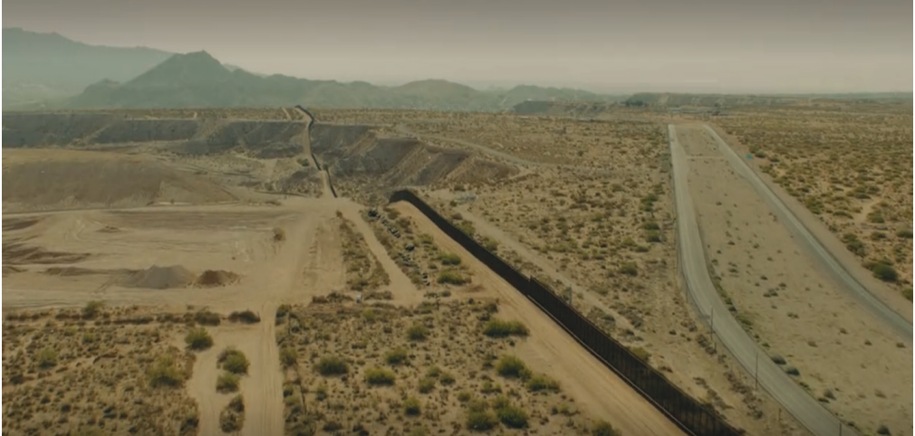
Figure 3. A long shot taken from above the physical border in the El Paso–Juárez region (00:24:19–00:25:24) from Sicario . Directed by Denis Villeneuve, performance by Emily Blunt, Josh Brolin, and Benicio Del Toro, Lionsgate, 2015. Netflix.

physical borderland and the border crossings to Mexico. In the first crossing to Mexico, the circular movement of the camera lens from above is essential to cover the physical border fences fully. The different fragments of the border fence built in the region of El Paso–Juárez infiltrating the desert were captured by the camera. 32