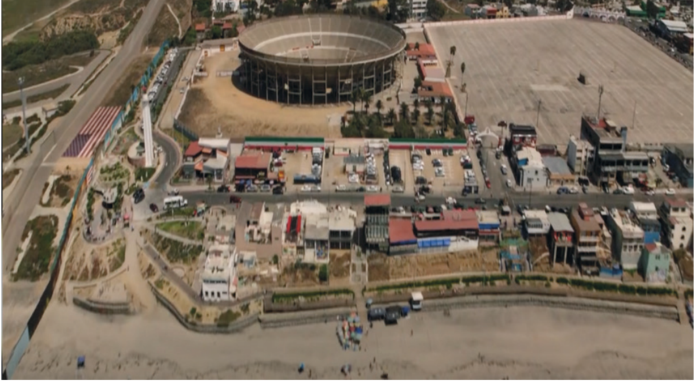
Figure 1. The Tijuana–San Diego dividing line from the movie Miss Bala . Performance by Gina Rodriguez, Sony Pictures Releasing, 2019.

A similar realistic photograph John Moore took shows the representation’s resemblance and accuracy. 19