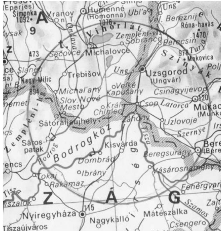
Figure 2: Map of the tri-border region