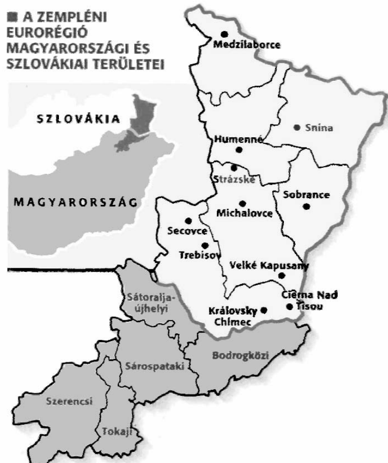
Figure 3: The Zemplén Euroregion