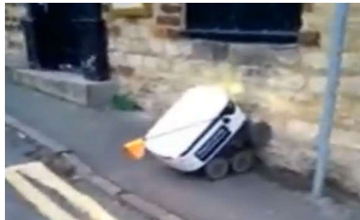
6. Delivery robot getting confused

At the end of each scene, the subjects were asked to evaluate their sense of safety in the above-mentioned three roles on a scale of 1 to 10, where 10 refers to the highest degree of safety and 1 indicates the highest level of danger. 16 persons participated in the series of interviews, 10 women and 6 men.