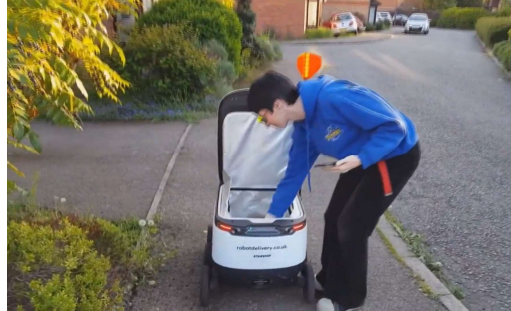
2. Successful delivery