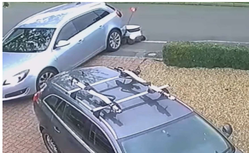
5. Delivery robot having an accident