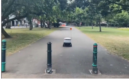
1. Delivery robot travelling without disturbances