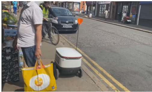
3. Delivery robot in heavier traffic