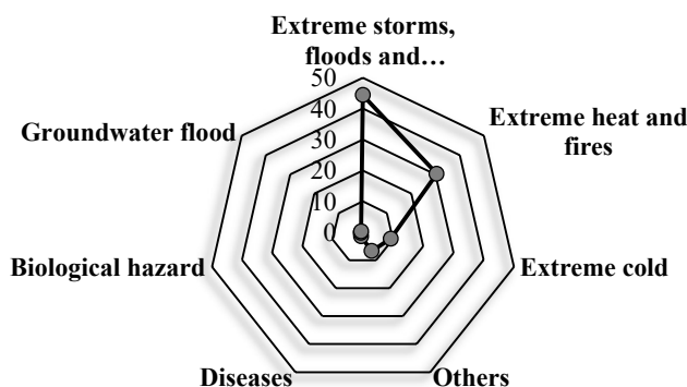
Figure 1. Frequency of climate risk identified by 16 cities examined