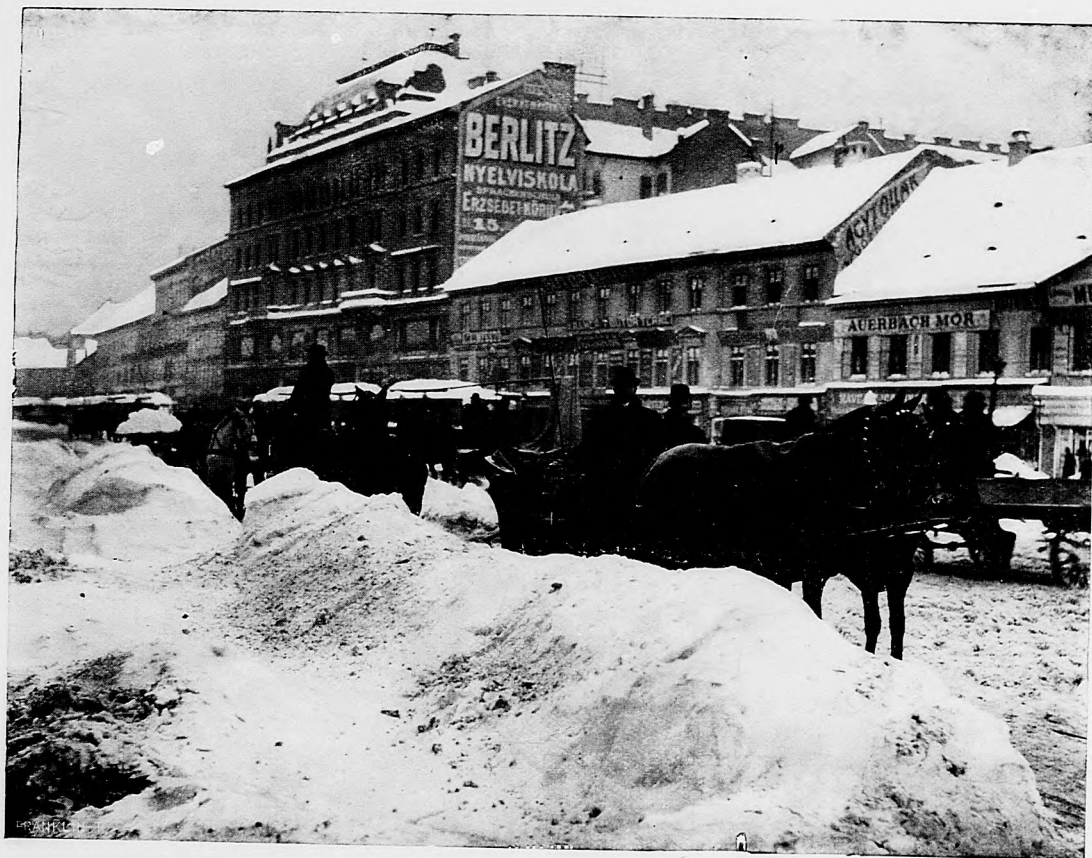
III. ON THE KÁROLY RING, BUDAPEST.

The «Határüzlet» (contracts for fixed periods)