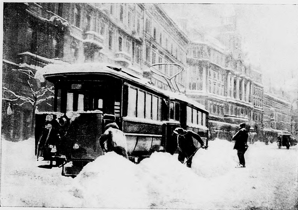
V. ELECTRIC TRAM STUCK IN THE SNOW, ON THE ERZSÉBET RING BUDAPEST.

But how far are we from this! We want a great deal of capital, and dependable workmen, also many decades must elapse before any effect is produced.