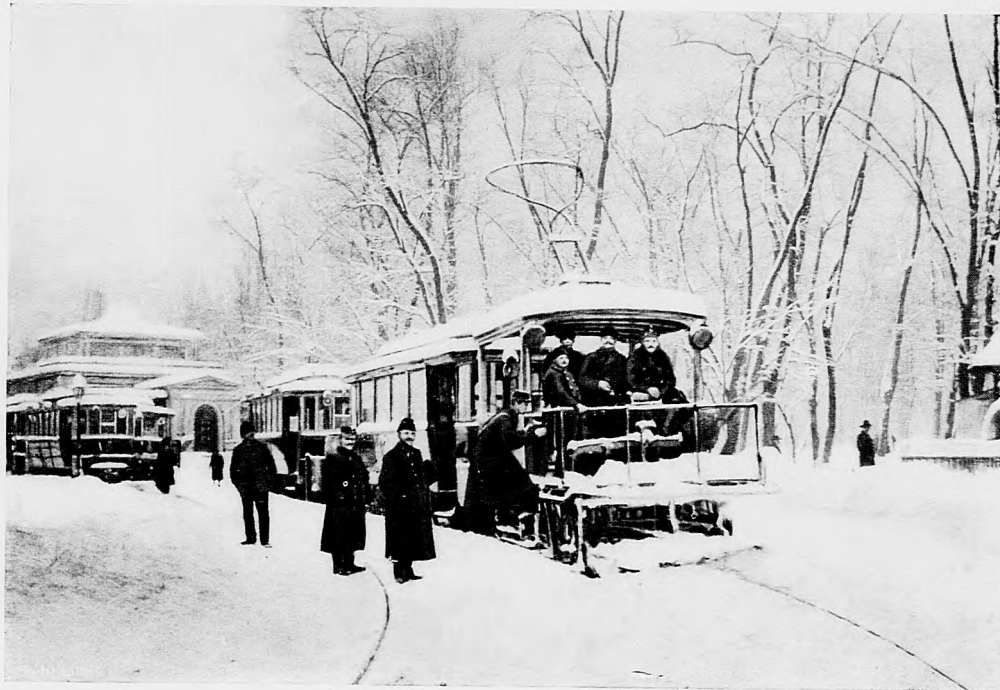
IV. ELECTRIC TRAM CLEARING THE SNOW, TOWN-PARK, BUDAPEST.

The erection of an Industrial Clothing School was next discussed, the Minister of Commerce,