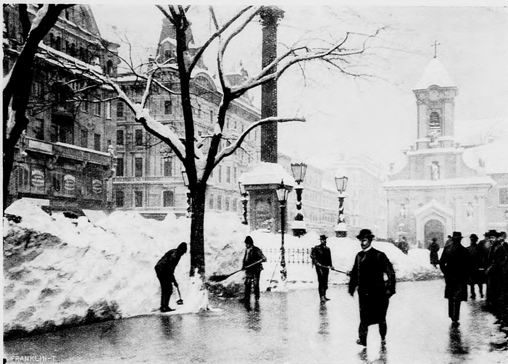
II. NEAR THE ROKUS HOSPITAL, BUDAPEST.

In compliance with paragraphs 56 and 60 of the Statutes 988.032 crowns (£ 41.167) are to be de-