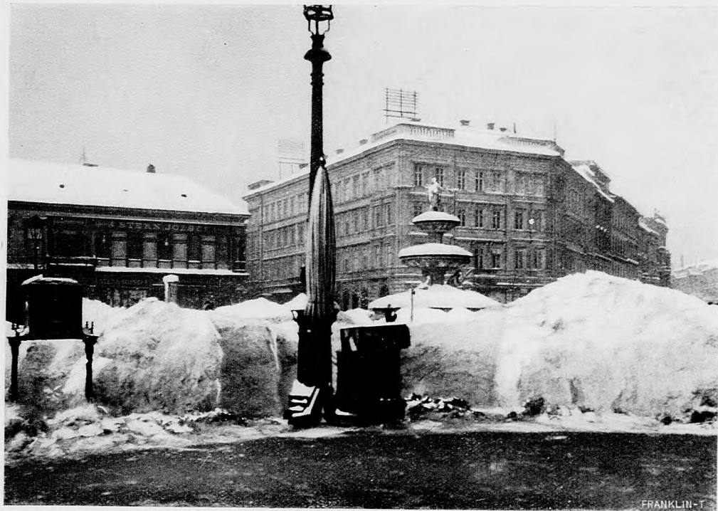
I. THE HEAVY SNOW FALL. CALVIN SQUARE, BUDAPEST.

HOWEVER great or small a position we may hold in this world, whether it be political or commercial, the acknowledgement of our services