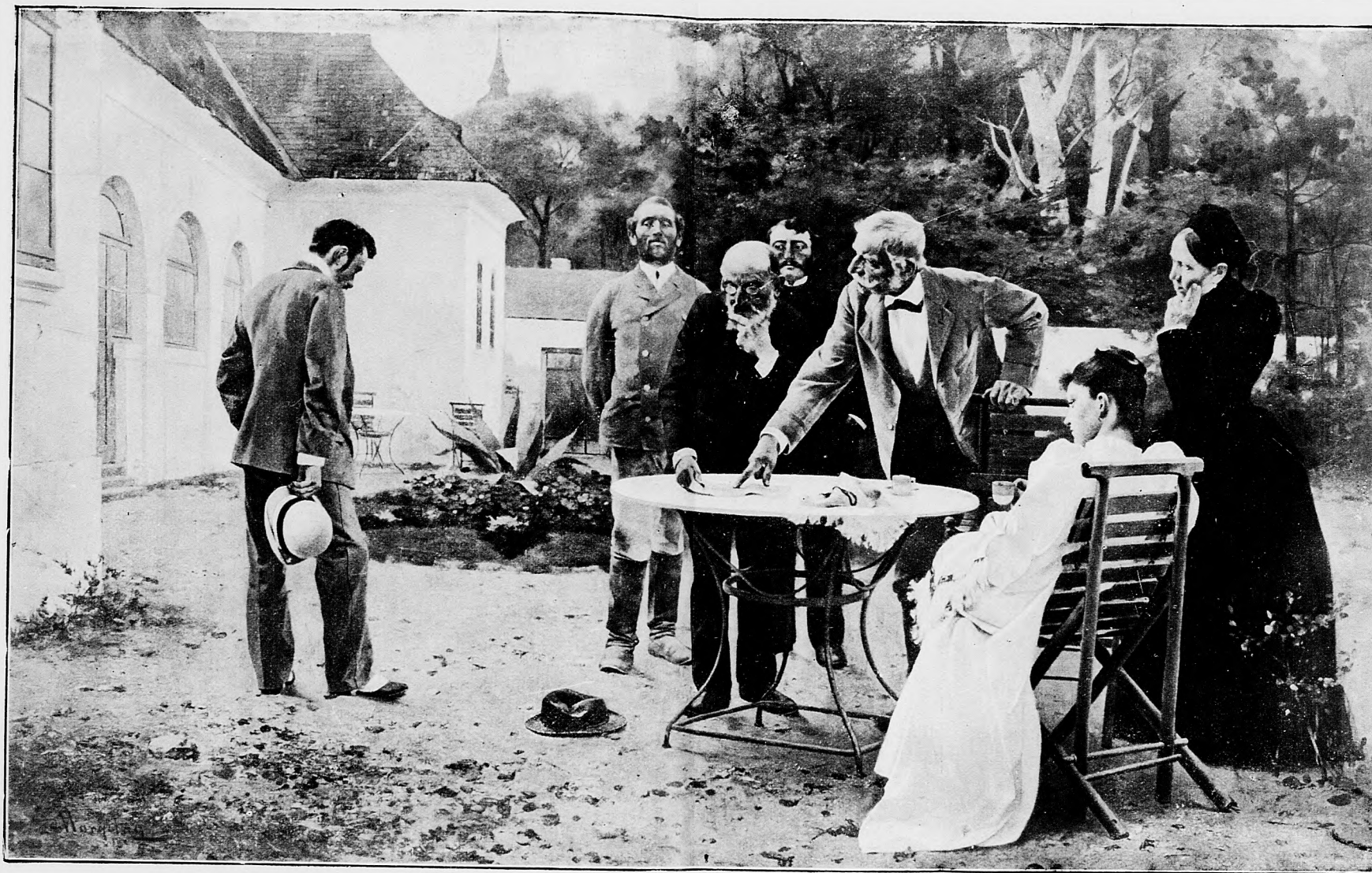
DID YOU SIGN THIS BILL?

THE YEAR 1886 ushered in a new epoch. New leaders now entered upon the scene, one above all others deserving mention, because with his noble