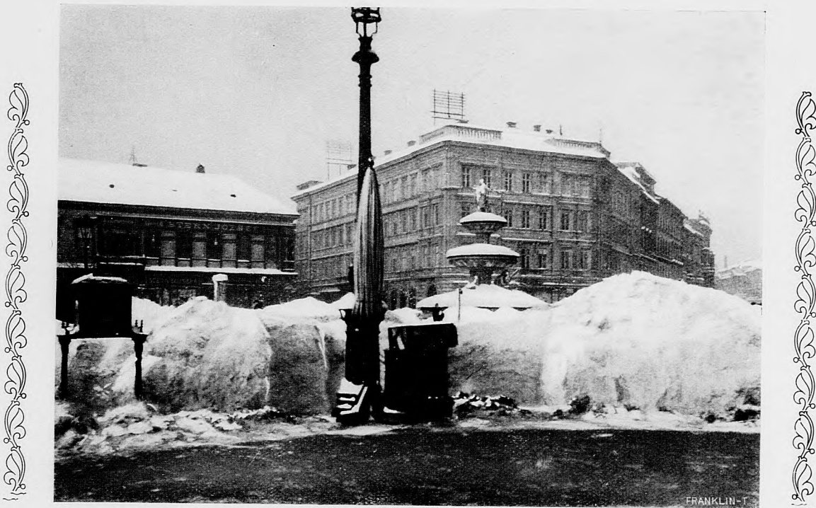
I. THE HEAVY SNOW FALL. CALVIN SQUARE, BUDAPEST.

HOWEVER great or small a position we may hold in this world, whether it be political or commercial, the acknowledgement of our services