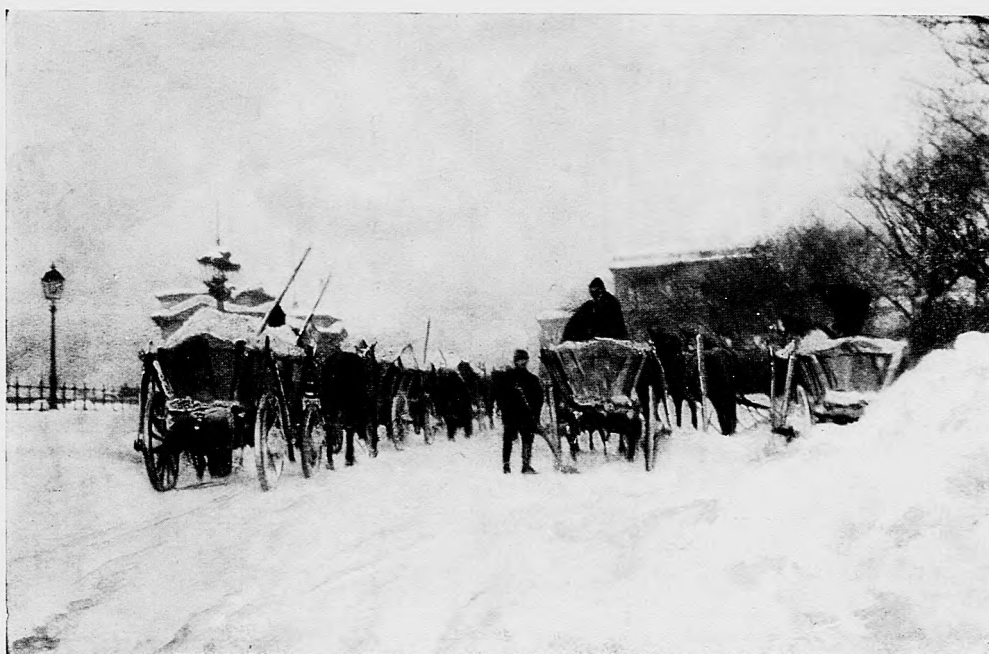
VI. CARTING THE SNOW INTO THE DANUBE, BUDAPEST.