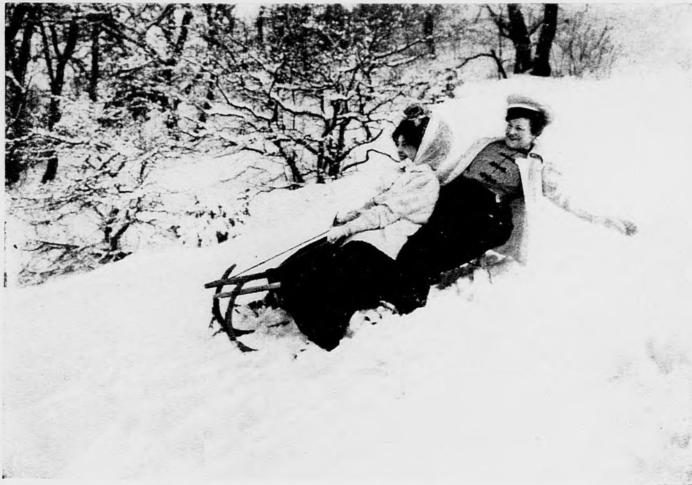
Winter in Budapest: «Merrily O!»

«Table of Nuncios» being often a mere formality. From time immemorial these sittings have been public, but there are no official reports