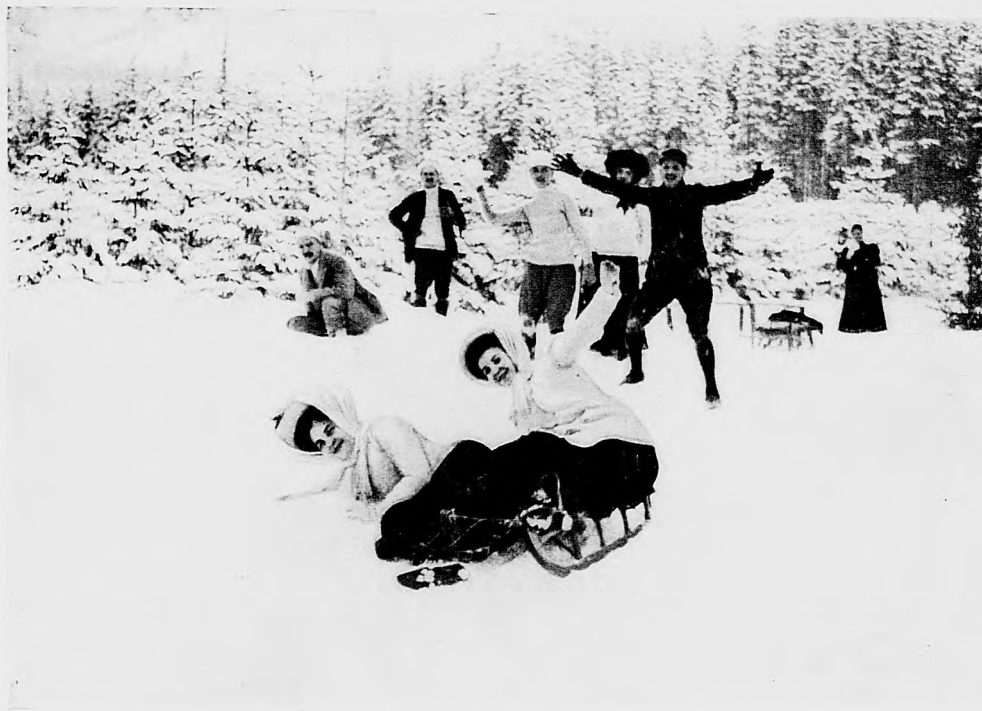
Winter in the High Tatra: A Toboggan «Spill».