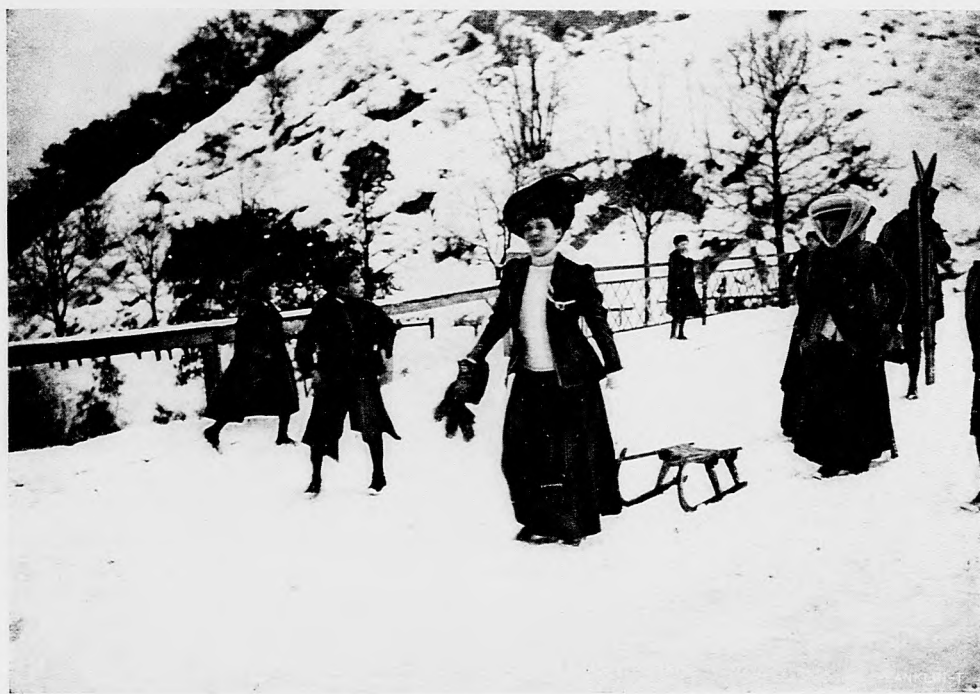
Winter in Budapest: On the Buda Hills.

Before describing the herds of these fine mares which were seen and the method of selection, it may be well to refer to some of the sires used with other groups which were stabled at Mezőhegyes. The first brought out was a thoroughbred English sire, Carasco, the grandson of Buccaneer, and which now serves mares chiefly of the Gidran group. He is by Batond out of Cancan and was winner of the Vienna Derby stakes. If he were