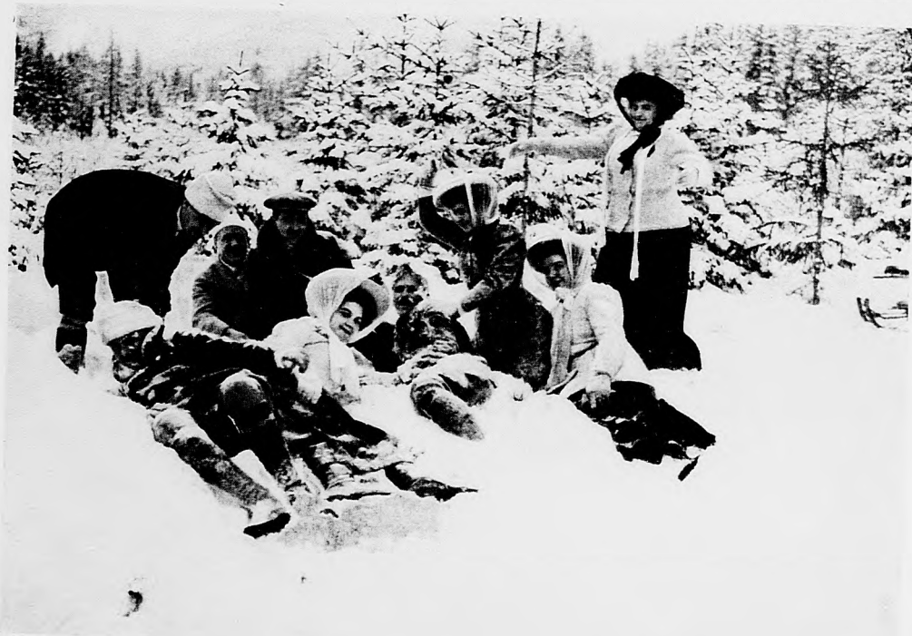
Winter in the High-Tátra: A cool resting-place.

ON THE 21 st ult. the most important function of the Carnival Season took place in the Fancy Dress Ball at the Royal Palace, under the auspices of Their Royal Highnesses Archduke Joseph and Archduchess Augusta. An immense number of guests drawn from the aristocracy, ministers, poli-