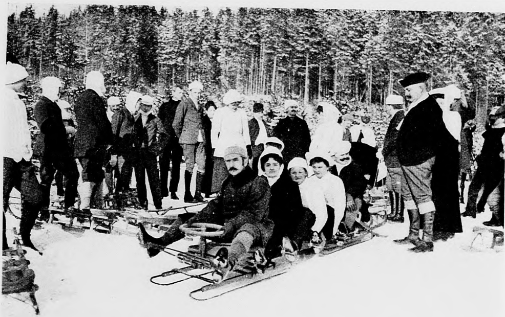
Winter in the High-Tátra : Tobogganing.

The steamship «Mauretania» of the Cunard Line, has just made the crossing from Liverpool to New-York in 4 days, 12 hours, and 6 minutes, beating the «Lusitania» by 106 minutes, and thus breaking the latest record for the Atlantic journey.