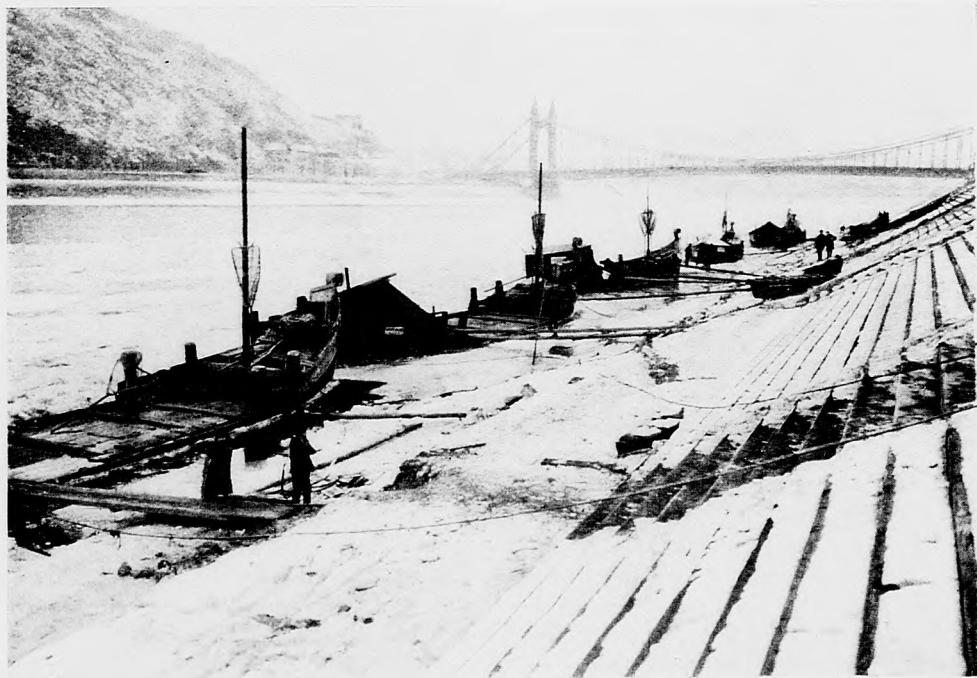
Winter in Budapest: Fishing-boats frozen in.

But this does not satisfy them. As a result of