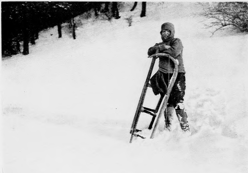
Winter in Budapest: A Rest.

The Nonius group, however, are both quicker and stronger than the lighter Gidrans , and even the Furiosos and North Stars . They have a longer stride and will trot one kilometer (two-thirds of a mile) in 2 minutes to 2 minutes 10 seconds. The method of trial and selection is instructive. When the mares are four years old they are raced together over a distance of about 2 miles (3,000 metres).