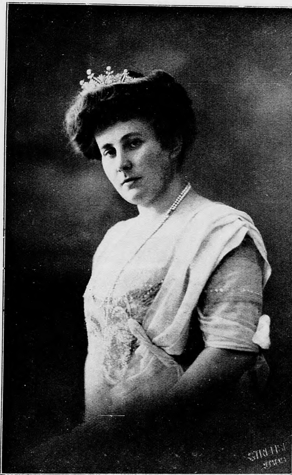
Countess James Zichy.

secondary lines, because the establishment of them was not interwoven with the direct interests of the land. The support of the interested districts was therefore necessary for that purpose, because the dividends of these lines were not likely to be such that private capital could undertake their construction without any support. In this way Act. 30 of 1880 and Act. 4 of 1888, which modifies it, were promulgated, which treat of the business of local railways, establishing the system of the support of the railways, of the contributions of those interested, determine the financing and the construction of these lines and order that the Hungarian State railways must undertake the administra-