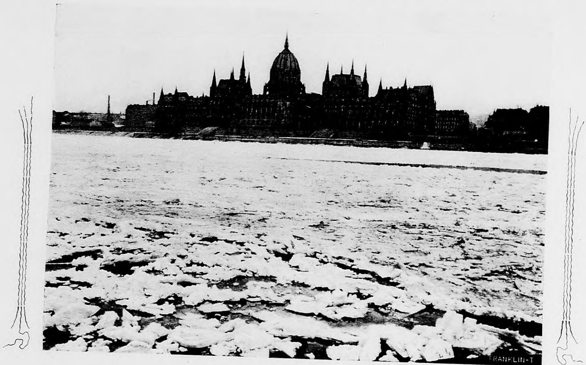
Winter in Budapest: Danube frozen over.

Hungarian love of poetry and also to the poetic talent possessed in no small degree by the people. There are some 45 poems in the book including