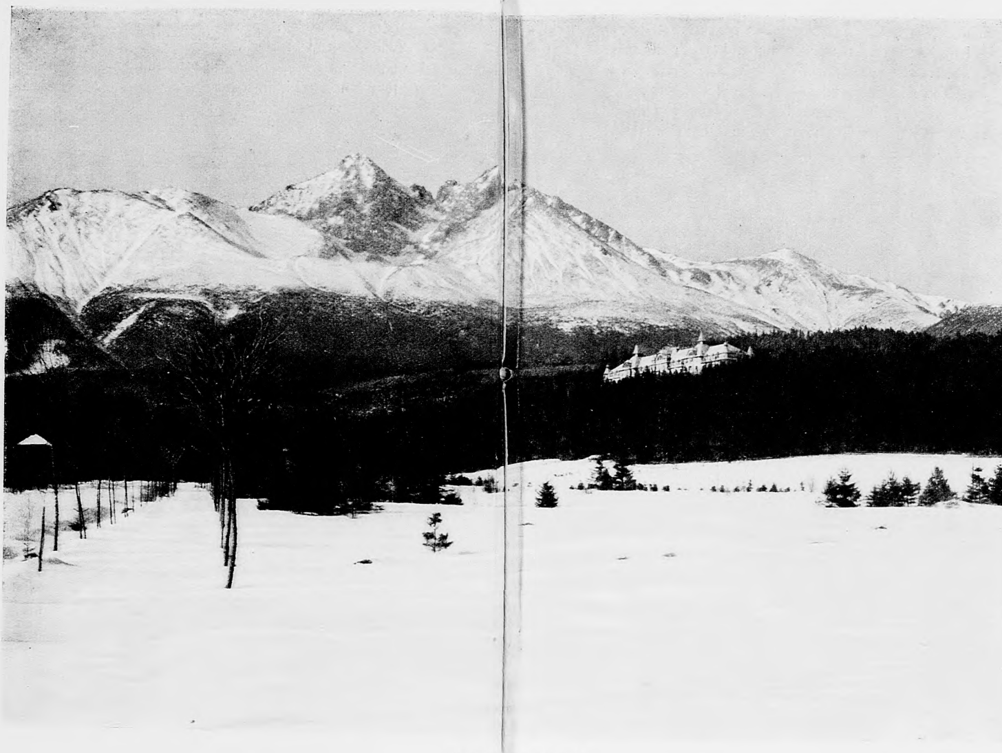
Tátra'orosz in Winter.

A terrible mine disaster has just occurred in Durham, and it is officially stated that 150 miners have been lost. Ninety bodies have been recovered. Two Members of Parliament descended the mine