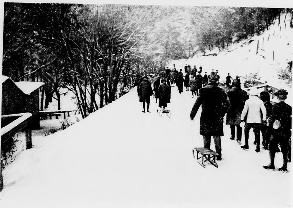
Winter in Budapest: On the Buda Hills.

Having seen the chief stud farm for cross-bred horses at Mezöhegyes, with its fine ranges of buildings, and admired the shapely sires which were brought out for our inspection, and put through their paces in the spacious yards bordered with rows of that favourite tree of the Hungarians, the acacia, we took our places in the carriages which were thoughtfully provided by the military staff, and were driven through the adjoining country to visit the various herds of brood mares which roam at large on those huge stretches of