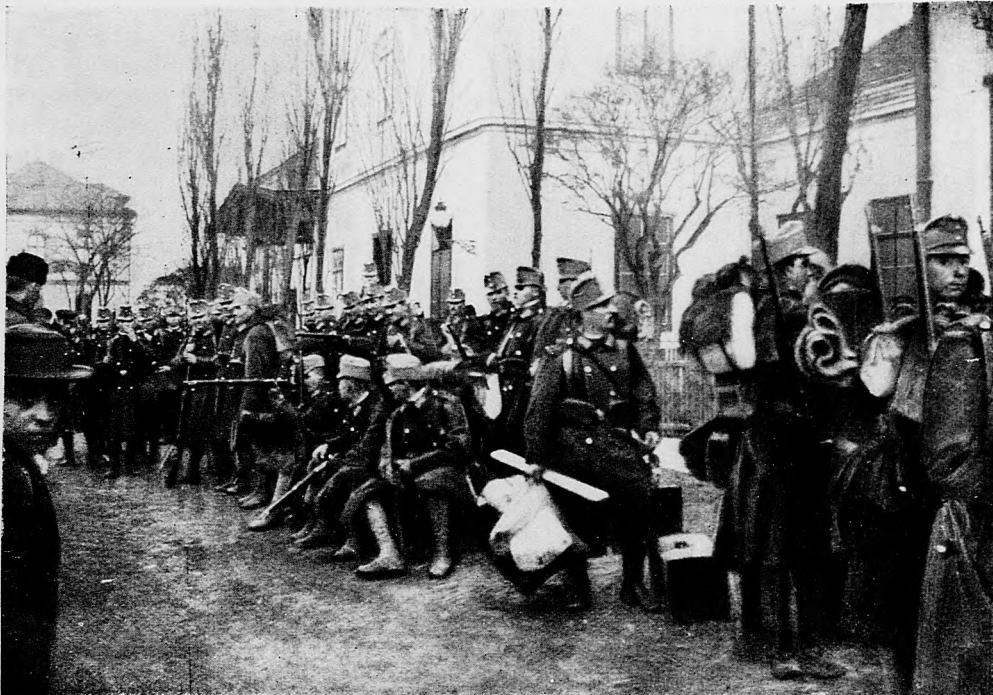
Hungarian Soldiers awaiting Entrainment.

village where he spent the days of his childhood. The poem is not a masterpiece, and far be it from me to commend it as such, but nevertheless it is an excellent poem and we appreciate it because of