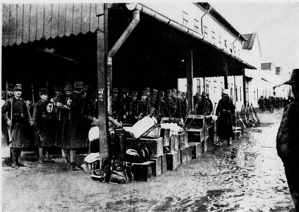
Hungarian Soldiers en Route for the Frontier.

monthly magazine, dealing with aerial matters and called «Aerocraft» has made its appearance with the opening of the exhibition.