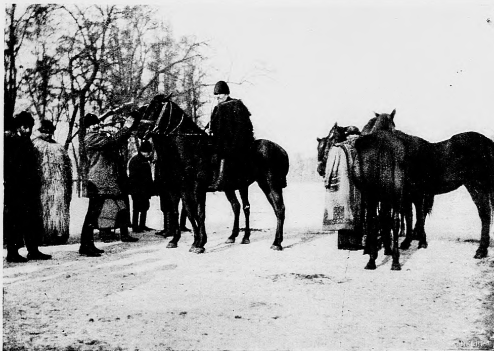
Winter on the Lowlands: «How old is this horse?»