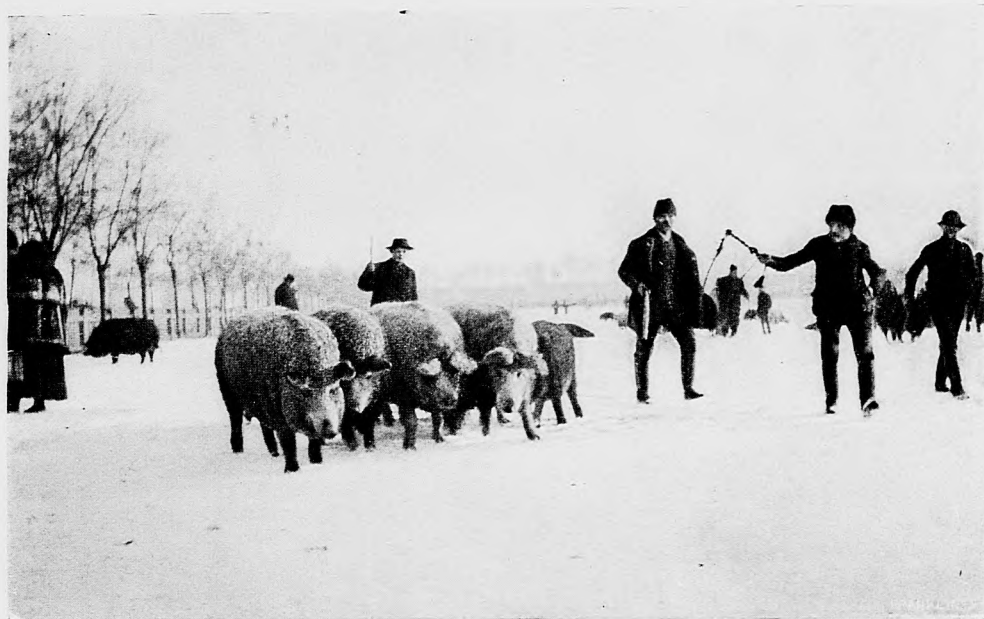
Winter on the Lowlands: Debreczen Pig Market.

From the shipping traffic report for the period under review we find that, during the month, a total of 595 vessels have anchored in Fiume harbour, — viz: 563 laden and 32 empty. The laden vessels comprised 492 steamers and 71 sailers, while