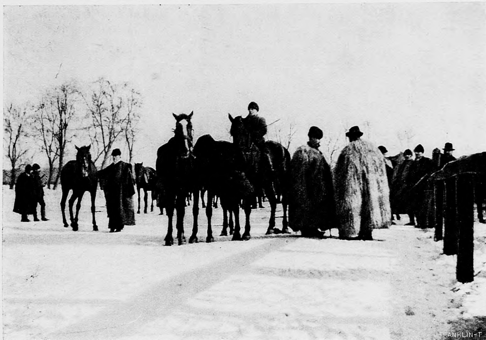
Winter on the Lowlands: Debreczen Horse Market.