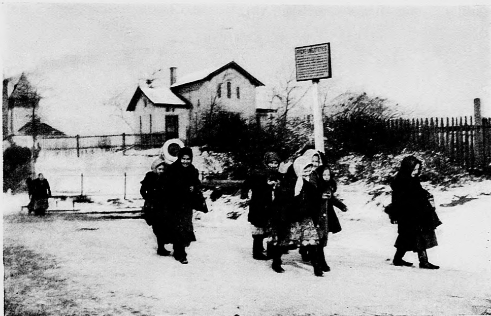
Children going to School.

The pursuit of industry in Hungary is protected by special laws, which constitute in themselves a distinct legislative domain. The legal provisions are intended to encourage the small manufacturers, and to secure their economic existence against the great industrial combines. The writer proceeds to give us an interesting historical sketch of the trade laws of France and Hungary.