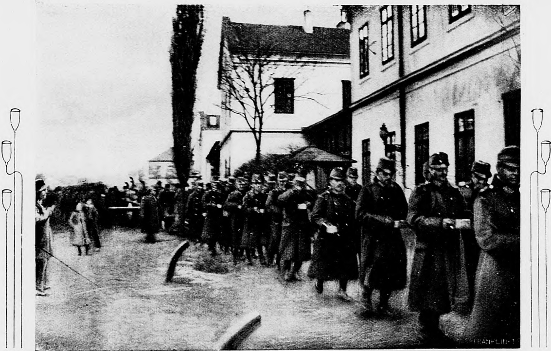
Hungarian Soldiers en Route for the Frontier.

The Prince and Princess of Wales are at present in residence at Marlborough House, and give much pleasure by their surprise visits to Hospitals and schools. Dr. Barnardo's Homes in Stepney Cause-