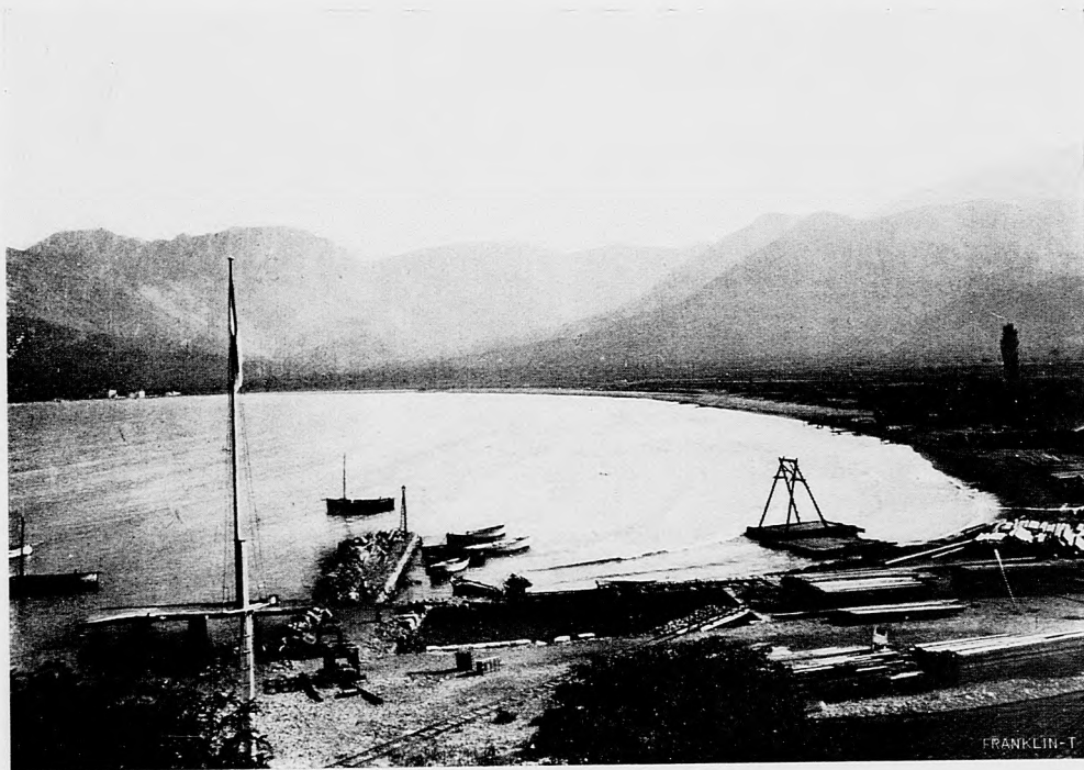
Antivari : Harbour Construction.

The 15 th of March was observed throughout Hungary as a day of general rejoicing. Special thanksgiving services in all the churches in the morning, gala performances and concerts in the afternoon and evening, processions of University