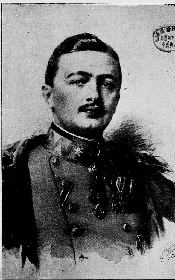
His Imperial and Royal Highness, Crown-Prince CHARLES FRANCIS JOSEPH, Lieutenant-Field-Marshal and Vice-Admiral.

The people of Ireland employ every possible means of demonstrating that this war is none of theirs. It is true that they are but a small fraction in the camp opposed to the war, but the effectiveness of their opposition is amply