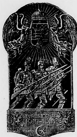
WAR FLAG-NAIL, in bronze, a memorial prepared by the Emblem-Section of the Army-Aid Department. — Price 15 crowns.