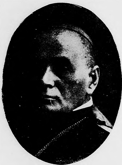
Dr. John Csernoch

It is long since the see of Esztergom was held by a Primate of such energy and indefatigable zeal as Dr. John Csernoch. His rise from humble estate to the position of highest ecclesiastical dignity in Hungary is indeed due to his own brilliant talents and untiring perseverance. The world-war has brought about many changes, but the Primate has continued unchanged to exercise the functions of his high office with his customary lofty sense of duty. He appears as a leader in all movements promoting benevolence. To the war-loan he has subscribed five million crowns and has, up to the present, given more than two hundred thousand crowns for charitable purposes, in addition to maintaining, at his own cost, the great military-hospital of Esztergom, which he visits regularly, dispensing comfort and consolation to the inmates.